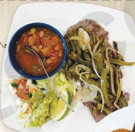
#1 CARNE ASADA

T-Bone Steak, Six Shrimp, Bell Peppers, Onions, Rice, Beans and Guacamole. 18.99