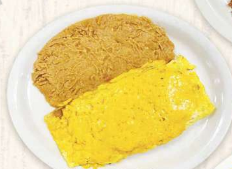
JALISCO OMELET PLATE