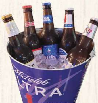
CUBETA DOMESTICA INCLUDES 5 BOTTLES 21.99

Try a Cucumber, Pineapple, or Mango Michelada +$1