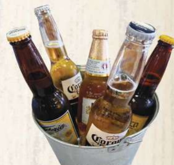
CUBETA IMPORTADA INCLUDES 5 BOTTLES 24.99