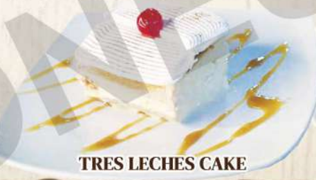
TRES LECHES CAKE