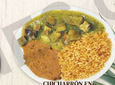
CHICHARRÓN EN SALSA VERDE