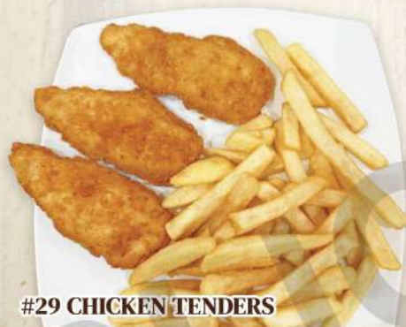
#29 CHICKEN TENDERS