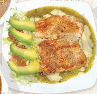
#49 ENCHILADAS TARASCAS

Three White Cheese Enchiladas and One Chicken Breast, topped with Tarasca Sauce, served with Rice, Salad and Avocado. 15.99