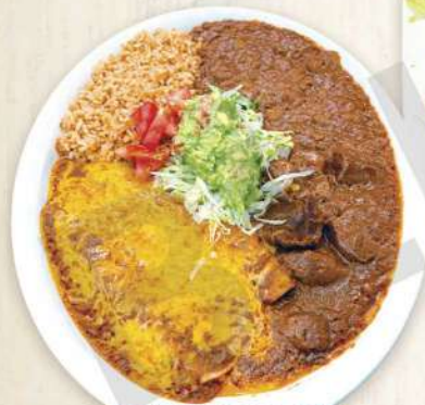
#10 TEXAS PLATE