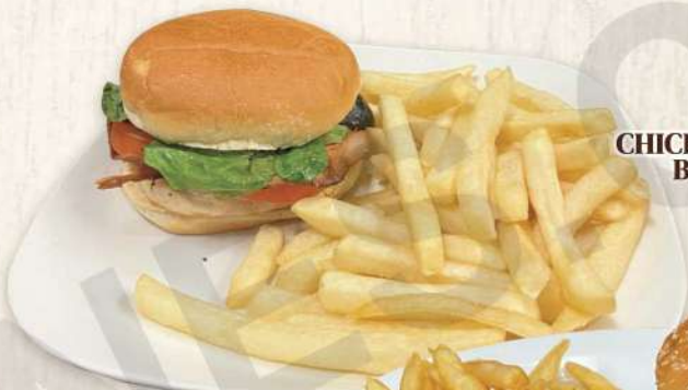
CHICKEN BACON BURGER