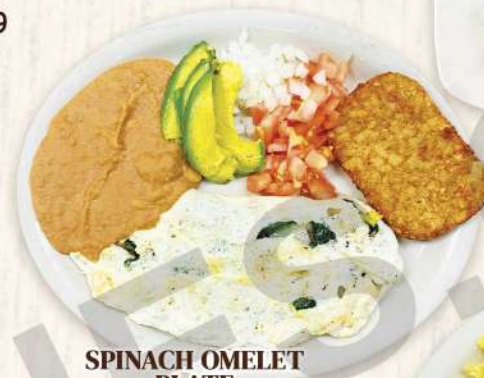
SPINACH OMELET PLATE