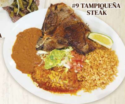
#9 TAMPIQUEÑA STEAK