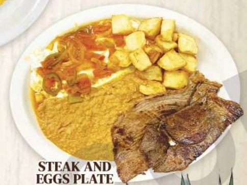
STEAK AND EGGS PLATE