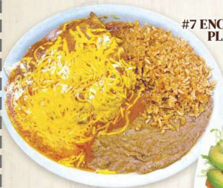
#7 ENCHILADA PLATE